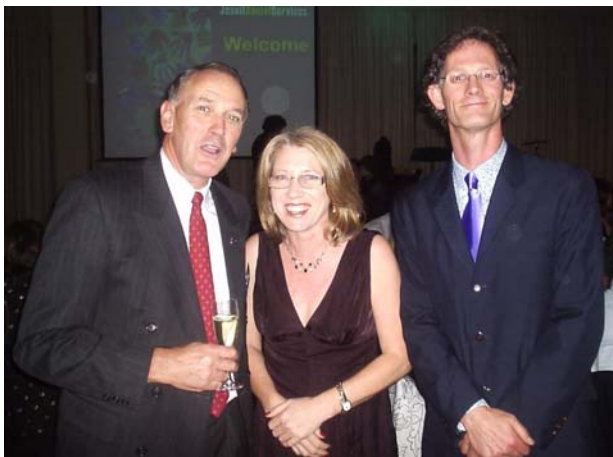
The Corporate Champs