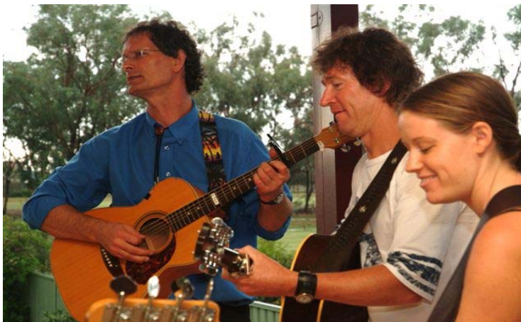
Champs launching the new album The Shack Tapes